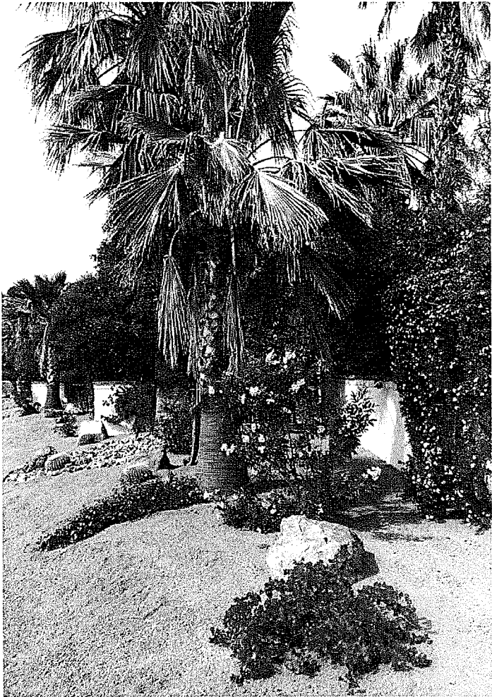
[Below] Recently-completed Avenida Granada section of desertscape. (Photo taken 3/20/16)